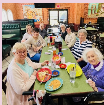
We enjoyed a delicious lunch at one of our favorite hangouts, San Jose!

This is a wonderful recognition of your hard work and dedication to our residents.