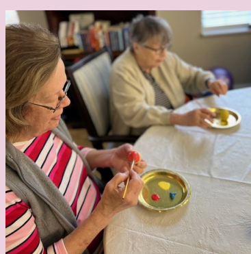
At Crafters' Corner, we painted our very own Easter egg creations. It was a great time of laughter and reminiscing about past Easter celebrations.